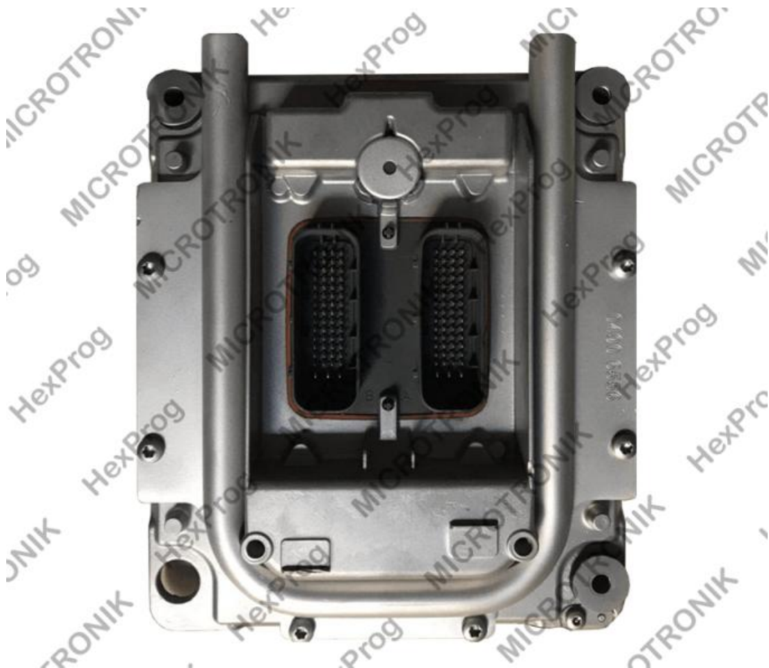
Renault Truck-EMS2.2 Gen2-Module

You cannot use OBD Flash files to write into the ECU